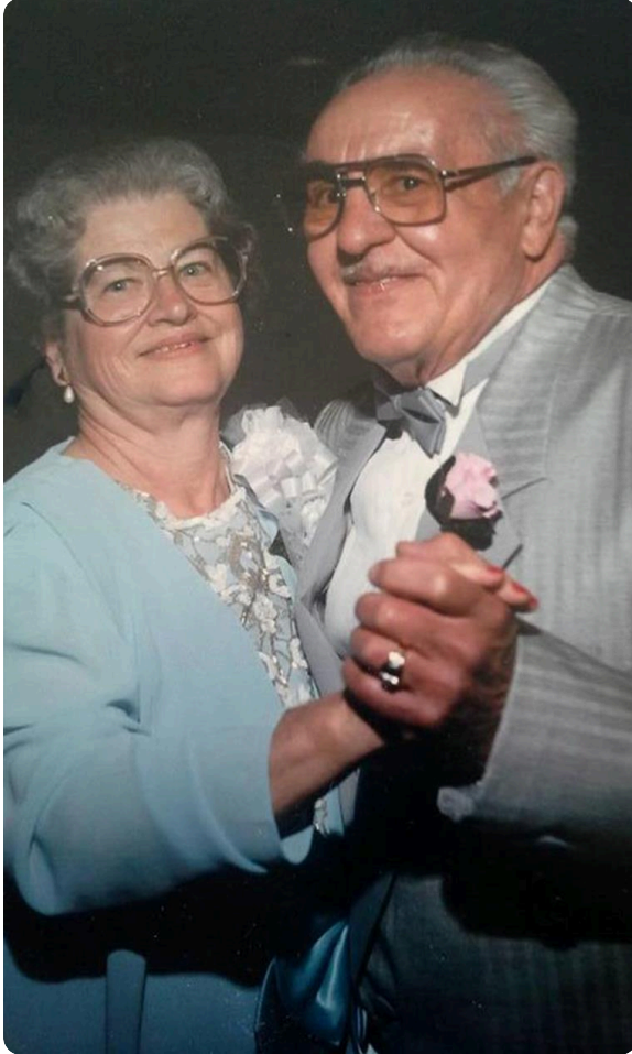
Mom & Dad June 1, 1991